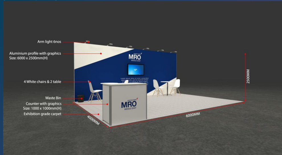
3 sides open

This document is strictly private, confidential and personal to its recipient(s) and should not be copied, distributed or reproduced in whole or in part, nor passed to any third party.