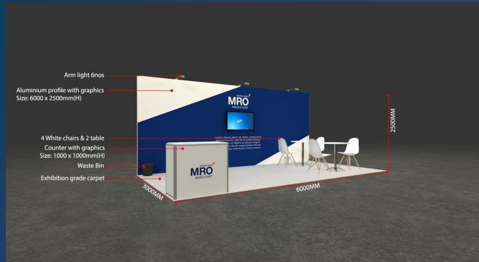
3 sides open