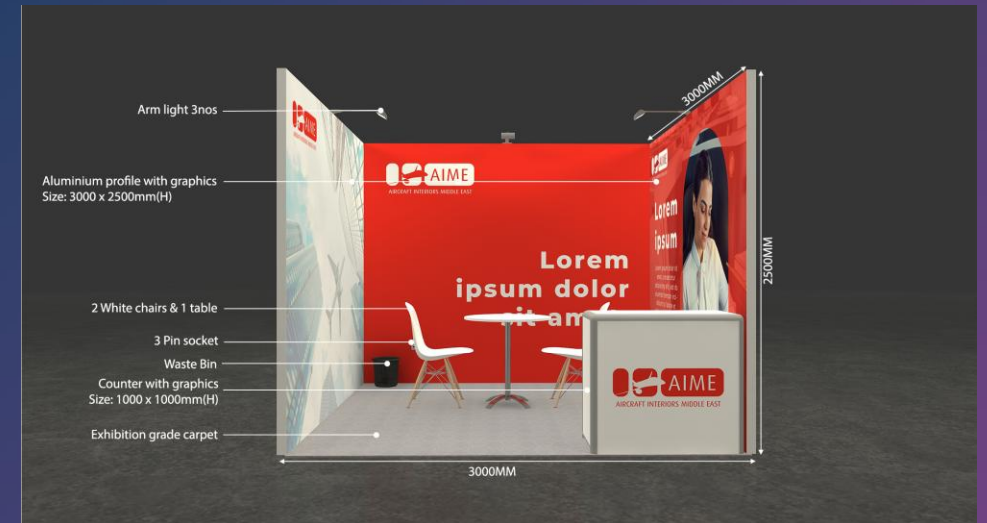
1 side open