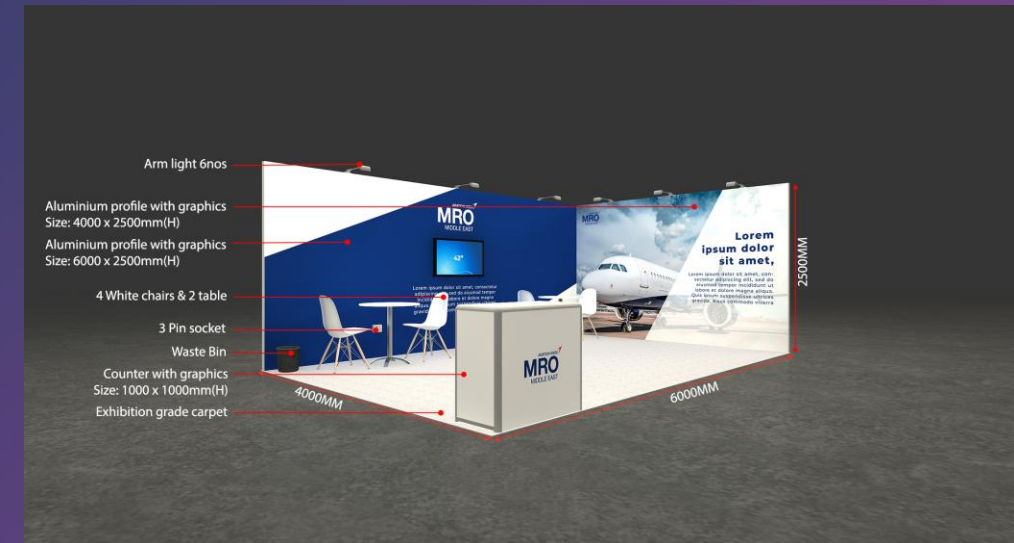
2 sides open