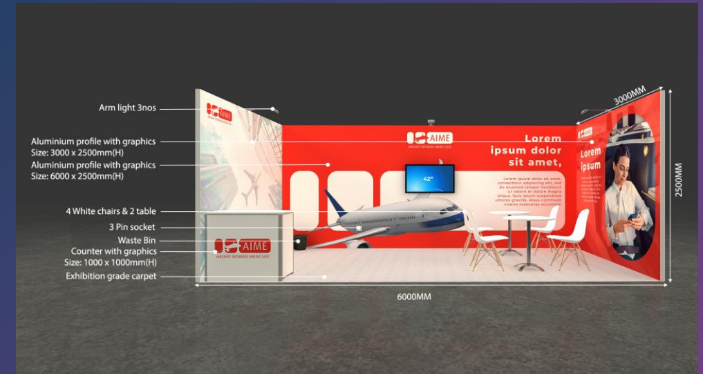
1 side open