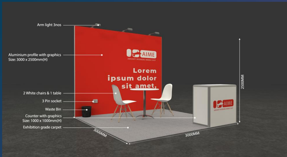
3 sides open