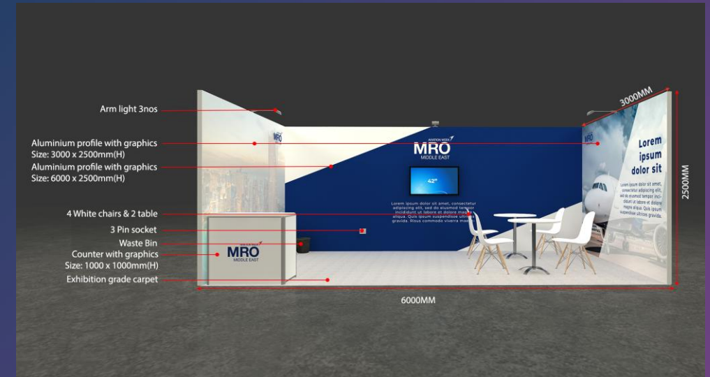
1 side open