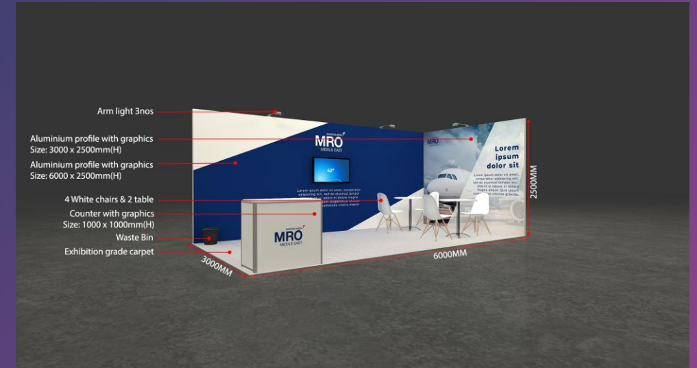
2 sides open

This document is strictly private, confidential and personal to its recipient(s) and should not be copied, distributed or reproduced in whole or in part, nor passed to any third party.