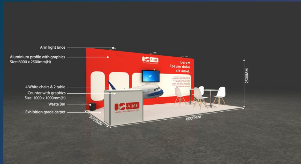
3 sides open