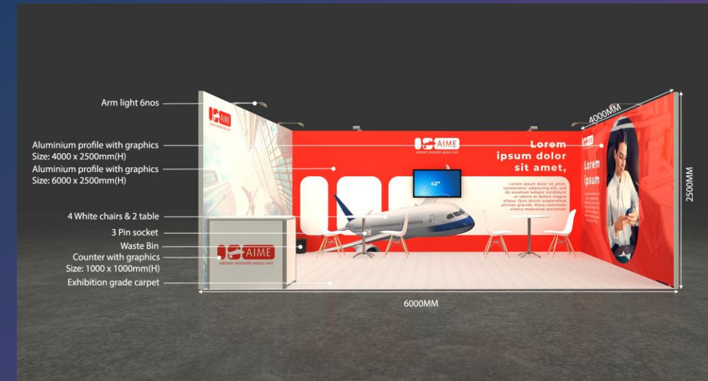
1 side open