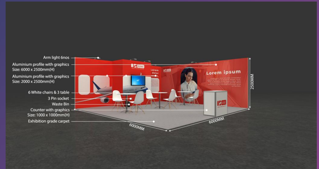
2 sides open

This document is strictly private, confidential and personal to its recipient(s) and should not be copied, distributed or reproduced in whole or in part, nor passed to any third party.