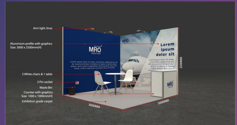
2 sides open