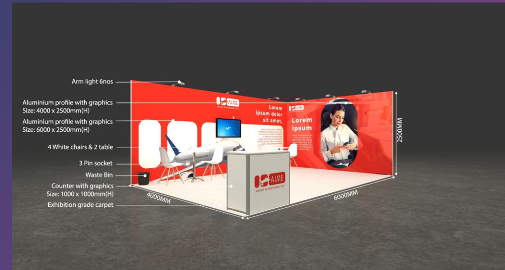
2 sides open

This document is strictly private, confidential and personal to its recipient(s) and should not be copied, distributed or reproduced in whole or in part, nor passed to any third party.