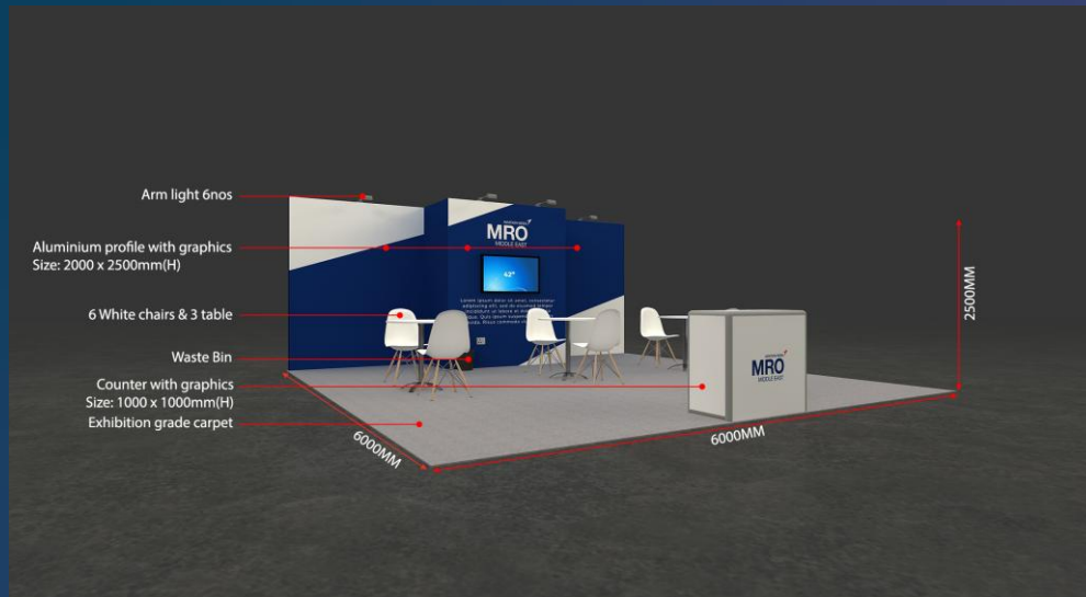
3 sides open