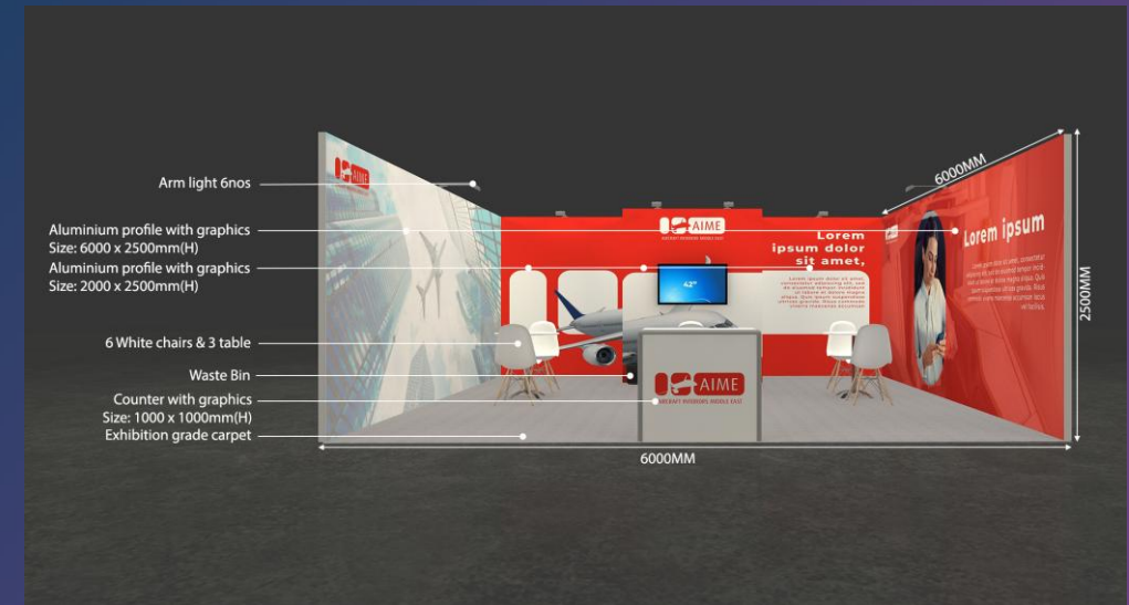
1 side open