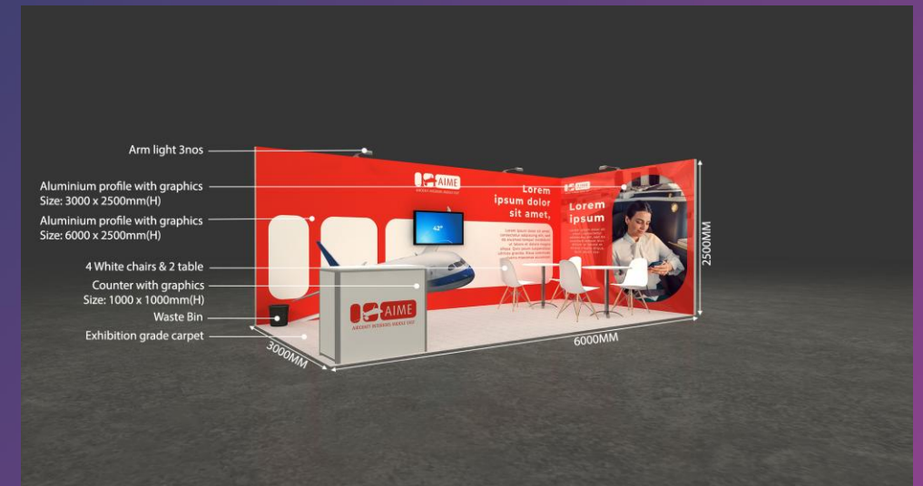
2 sides open

This document is strictly private, confidential and personal to its recipient(s) and should not be copied, distributed or reproduced in whole or in part, nor passed to any third party.