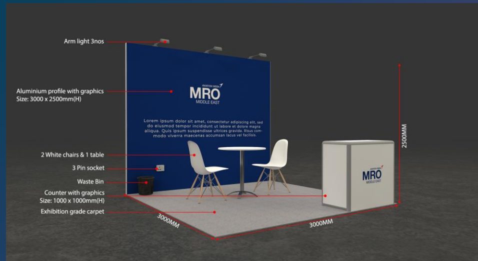
3 sides open

This document is strictly private, confidential and personal to its recipient(s) and should not be copied, distributed or reproduced in whole or in part, nor passed to any third party.