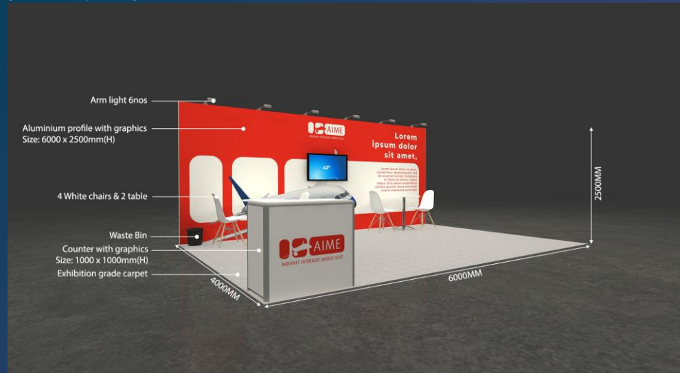
3 sides open