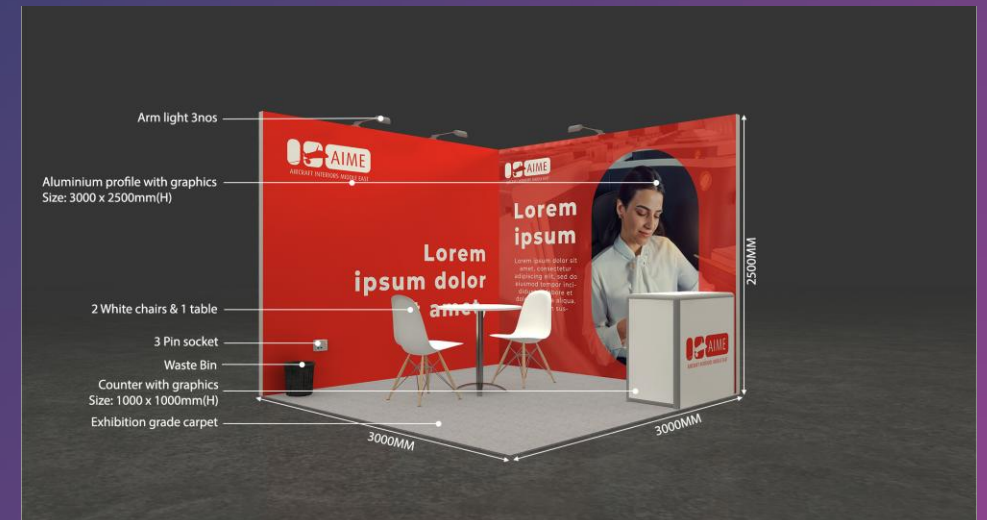
2 sides open

This document is strictly private, confidential and personal to its recipient(s) and should not be copied, distributed or reproduced in whole or in part, nor passed to any third party.