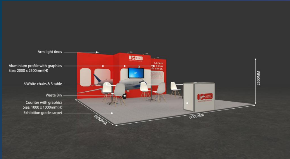
3 sides open